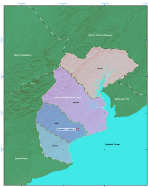
Figure 1. Research Location in Subdistrict Waru

The research method in this study used the survey method. The steps were carried out by the preparation stage, field survey, water sampling, laboratory analysis, and data analysis. It was organized for around 6 months, starting in January 2022. The laboratory analyzing water samples is the Regional Health Laboratory of Balikpapan City. The research location is shown in Figure 1 in Selulu Reservoir, Waru District, North Panajam Paser Regency, East Kalimantan.