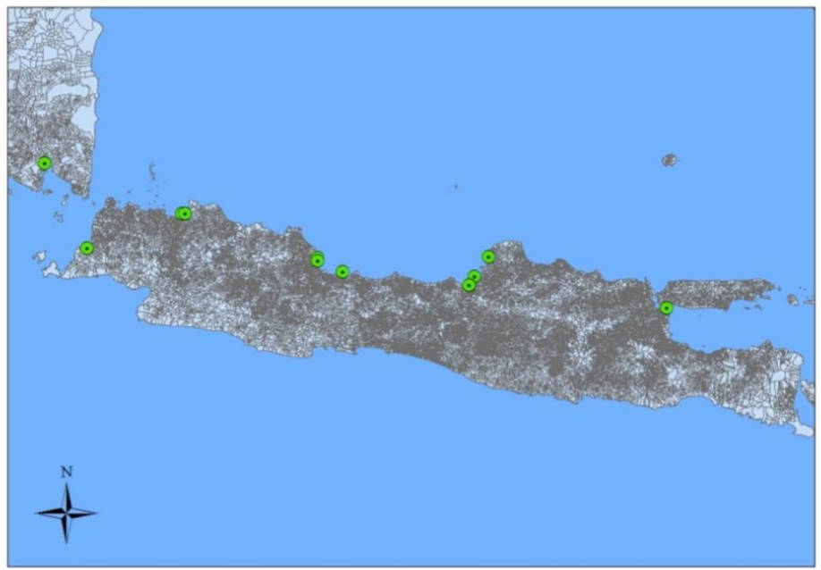
Figure 1. Green mussels sampling place.

Based on the studies that have been carried out in the article, there are 12 sampling locations for green mussels. The sampling locations consisted of Bandar Lampung, Banten, Jakarta, Cirebon, Brebes, Semarang, Demak, Jepara, and Surabaya. There are locations whose samples were taken as many as two points, namely Jakarta, Cirebon, and Semarang. The location of the green mussel sample can be seen in Figure 1.